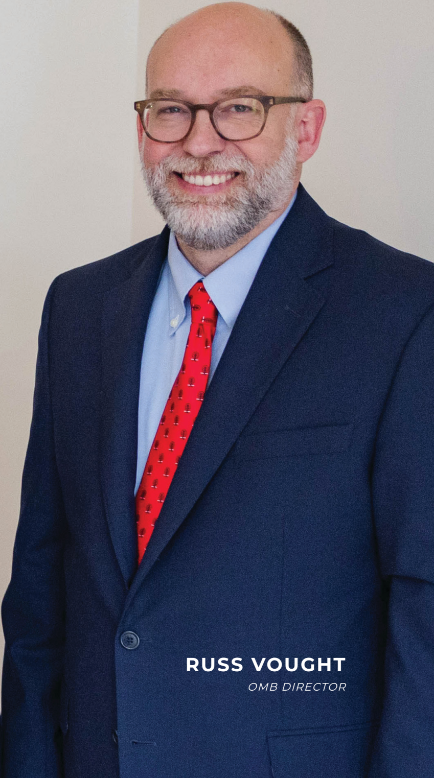
RUSS VOUGHT OMB DIRECTOR